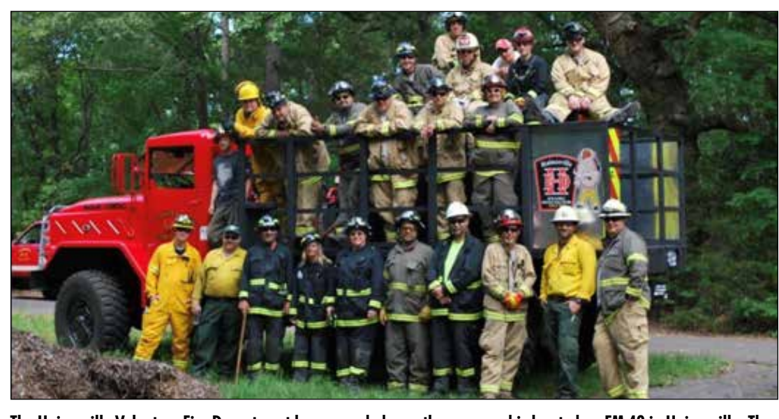
The Hainesville Volunteer Fire Department has expanded over the years and is located on FM 49 in Hainesville. They have their fire department headquarters and also house the Sam White Educational Building which is the former First Baptist Church in Hainesville. The department was formed in 1979 and has over 20 volunteers. The department serves the rural area east of Mineola and west of Hawkins.