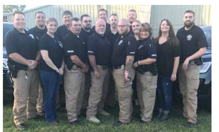
Winnsboro Police Dept.